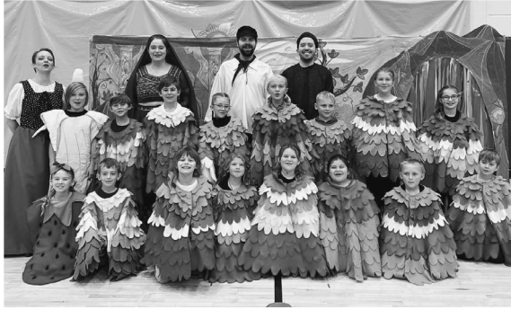
Pictured above: Third grade students participated in the Beauty and the Beast opera by singing and dancing.